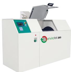
Envirotek250 Medical Waste Treatment System Item # ET250