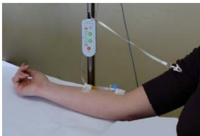
Using with set of driper

At low speeds of flow at the outlet heater uses a special thermal protection infusion tube