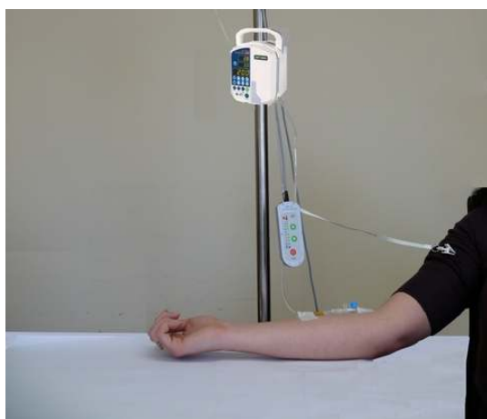
Using with infusion pump