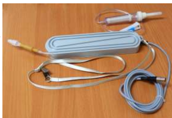
DIAGRAM OF HEATING FOR MEDICAL INFUSION FLUIDS