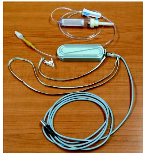
DIAGRAM OF MEDICAL INFUSION FLUIDS